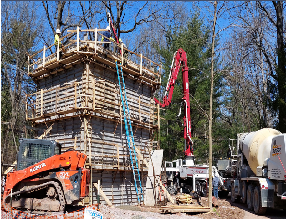
Pouring the walls.

As mentioned previously, the mild winter weather remains in our favor and the project remains on target. We thank you for your water conservation efforts during this time when we are purchasing water from the Mt. Gretna Authority.