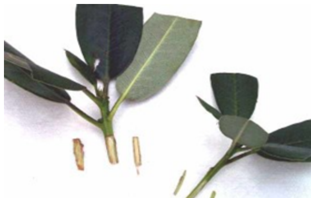
STEP 3: Rhododendron Cuttings.

Step 3. Use your blade to strip about an inch of bark from the base of your cuttings. If your cuttings have large leaves (this will be the case with some rhododendrons), trim off the ends of the leaves. What you end up with should look something like this: