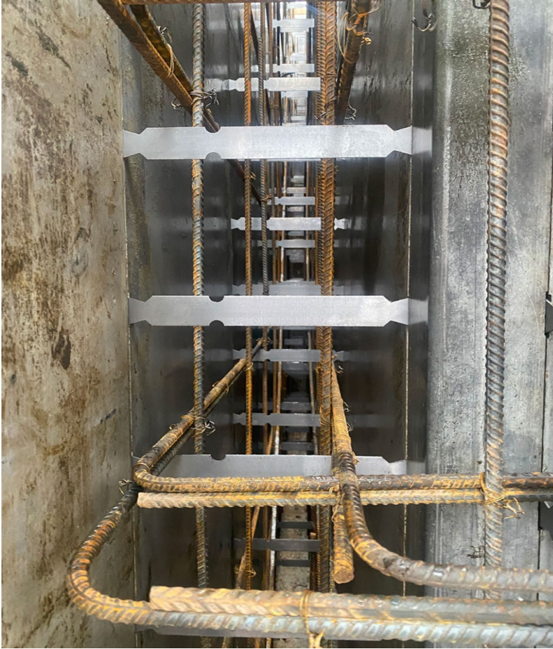
Rebar inside the wall forms, before pouring.