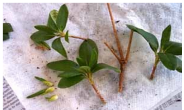
STEP 2: Azalea Cuttings.

Step 2. Choose a young upright branch, one that's light-colored and pliable 5 . Look for one without a bud, if you get a bud on your cutting, no problem, you can remove it later. Cut straight across the branch with your blade, about 3 to 6 inches from the tip. Remove the lowest leaves, and the bud, if it has one 5 . Your cuttings should look something like this: