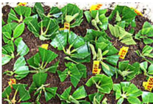
STEP 4: Rhododendron cuttings in potting mix.

Step 4. Dip the tips of your cuttings into the rooting hormone, and stick the cuttings into your potting mix. You can put them pretty close to each other, because when their roots begin to grow you'll be moving them out of this container anyway.