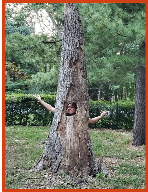
Submitted by Kenton Erb