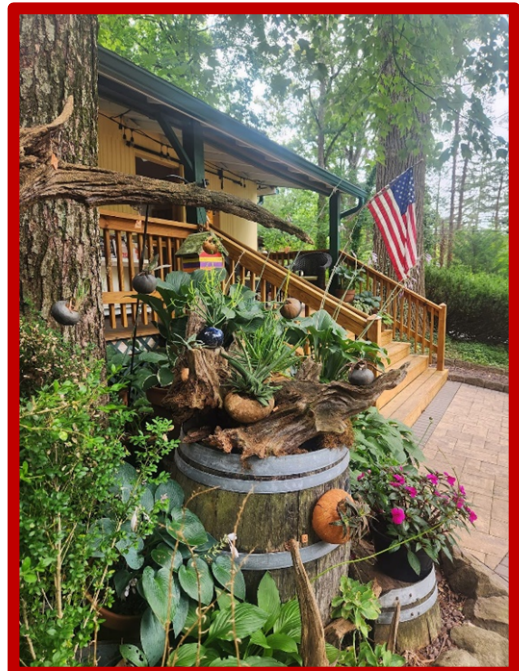
Submitted by Michelle Shay

Beyond community norms, crossing property lines can lead to legal conflicts. It is crucial to avoid actions that might unintentionally result in disputes and disagreements among neighbors. Before engaging in any activity that might extend beyond your property boundaries, always seek permission from your neighbors. A quick conversation can go a long way.