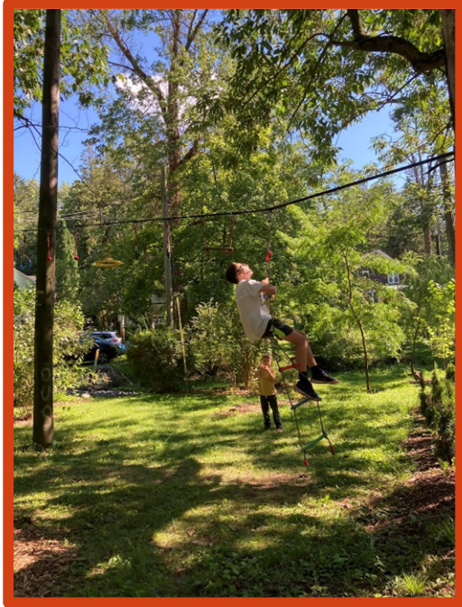
Submitted by Pat Wilmsen