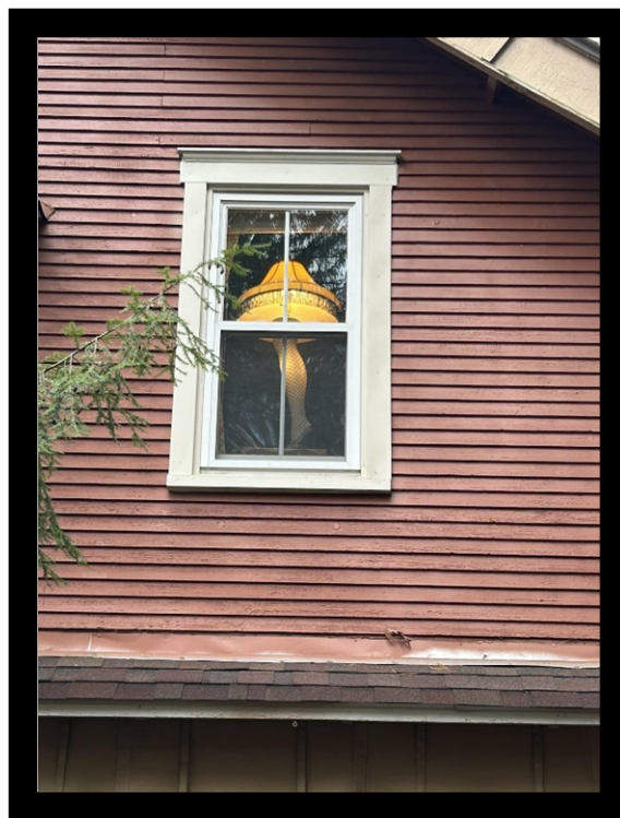
Submitted by Andy Berfond

Together, as a community, we can all do our best to conserve water. When a similar notice was sent to Members last year, water usage reduced by nearly 2,000 gallons per day. Every bit helps!