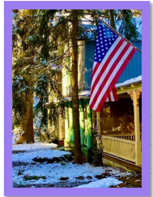
Submitted by Leesbaun Musick

Serene Green is a traditional bluegrass band, originating from Pennsylvania. Serene Green's desire is to honor the traditional side of bluegrass demonstrated by the pioneers of the genre, while also showcasing its original compositions and uniqueness. Since the band's inception in 2017, Serene Green has played in three countries and in over twenty states, performed at countless festivals and venues alongside many nationally and internationally touring acts, and released three studio albums.