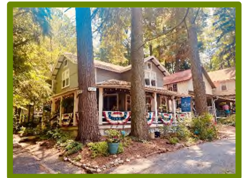
Submitted by Kevin Burd