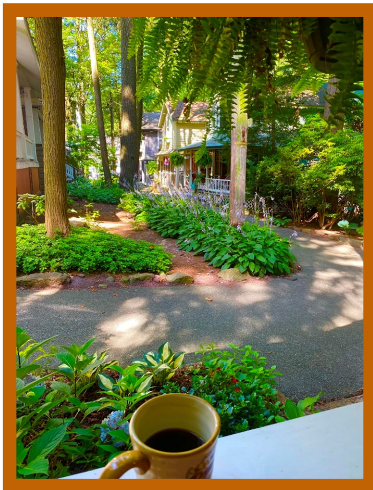
Submitted by Submitted by Leesbaum Musick

months when darkness falls earlier and earlier each day. If you notice a street light that is not working, please report it to the Office (with the location and pole number).