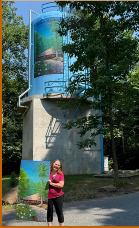
Submitted by Pat Wilmsen

Using charcoal or gas grills, as well as any other open-flame cooking devices, is prohibited on combustible covered porches. Fire rings, fire pits (permanent or portable), and deck/patio heaters are permitted, but they should not be operated on porches for safety reasons . It is important to ensure that all of these devices are equipped with a properly fitting spark screen cover over the open flame.