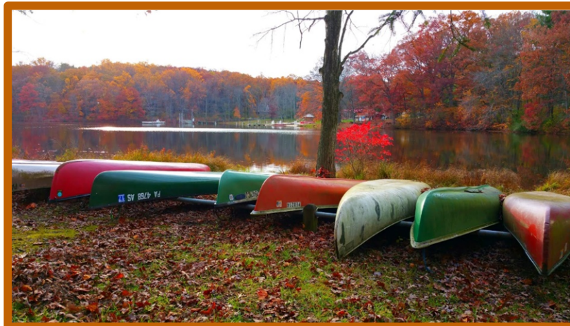
Submitted by Leeshaun Musick