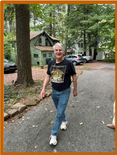
Submitted by Andy Berfond