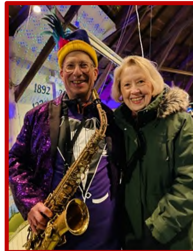
Submitted by Pat Brosious