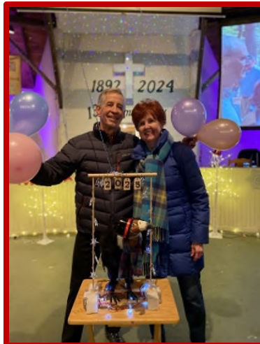
Submitted by Pat Brosious