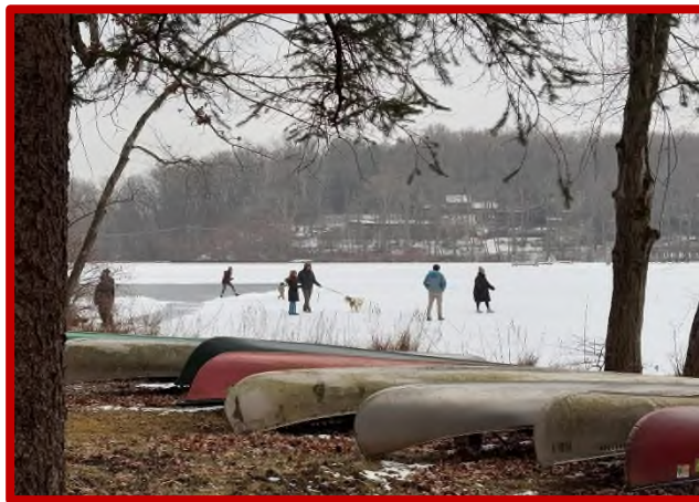
Submitted by Yasmin Brown

Members of local watershed and conservation groups will have information about what they do, what public events are scheduled, and how to become involved in protecting our water resources.