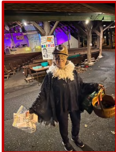
Submitted by Pat Wilmsen