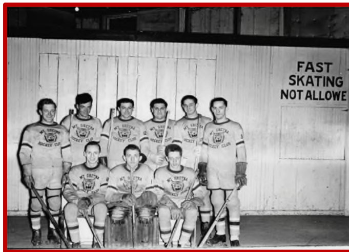
Mount Gretna Tigers Hockey Team - Photo Courtesy of the Mount Gretna Area Historical Society

By the mid-1920s, the building still had a dance floor, but roller skating had taken center stage. In May 1926, an ad for the grand opening of Mount Gretna Park featured roller skating in what was now called the Coliseum Building with “300 pairs of chic roller skates, a Gents smoking room, a vast spectators’ room and Wurlitzer organ.”