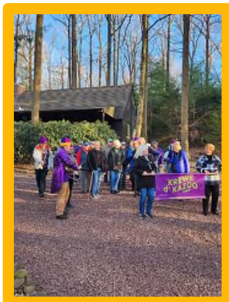
Pictures from the Krewe d’Kazoo Mardi Gras Stroll on Friday, February 28