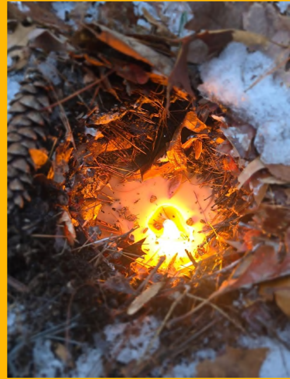
Submitted by Dermot Somers