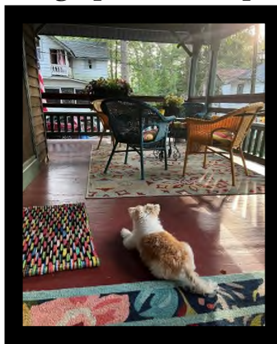
Winston is ready to welcome everyone back from winter adventures. Submitted by Kevin C. Wells