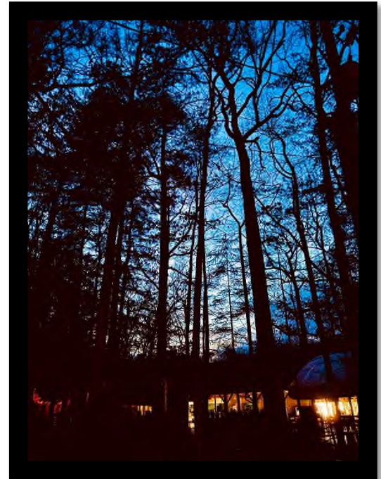
Submitted by Mary Dougherty

Our Garden, like everything in nature, is a work in progress. Right now, we've got taller plants which, frankly, don't exactly look like the cover of Better Homes and Gardens . These varieties are there for the benefit of those pollinators, who will work their magic to encourage the growth of shrubs and immature trees. Leaving the plant stalks up in winter provides homes for all life stages of these insects, from egg to pupa to larvae to adult. As the trees grow taller (we've noticed wonderful progress in our saplings and young trees!), their shade will cause those taller plants to die off, and our Garden will literally become a walk in the woods. Check out this link for more on pollinator plants: https://positivelypa.com/planting-for-pollinators/ .