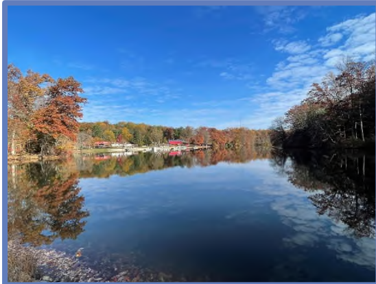
Submitted by Jim Erdman